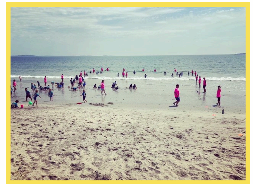
This photo demonstrates our water safety formation while at Bayview Beach.

On water trips, your child will never be in deep water. This age group stays in the shallow shin-deep water and are constantly and completely surrounded by counselors. On camp, we love to offer fun water games outside to beat the heat, so your camper will need a bathing suit and towel sometimes.